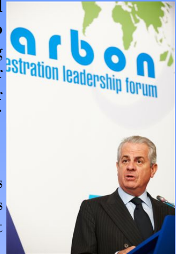
Minister Scajola speaks at the conference

Minister Scajola also reported on progress made towards combating climate change, following the recommendations of ministerial reunions and of heads of state and government during the Italian G8 Presidency.