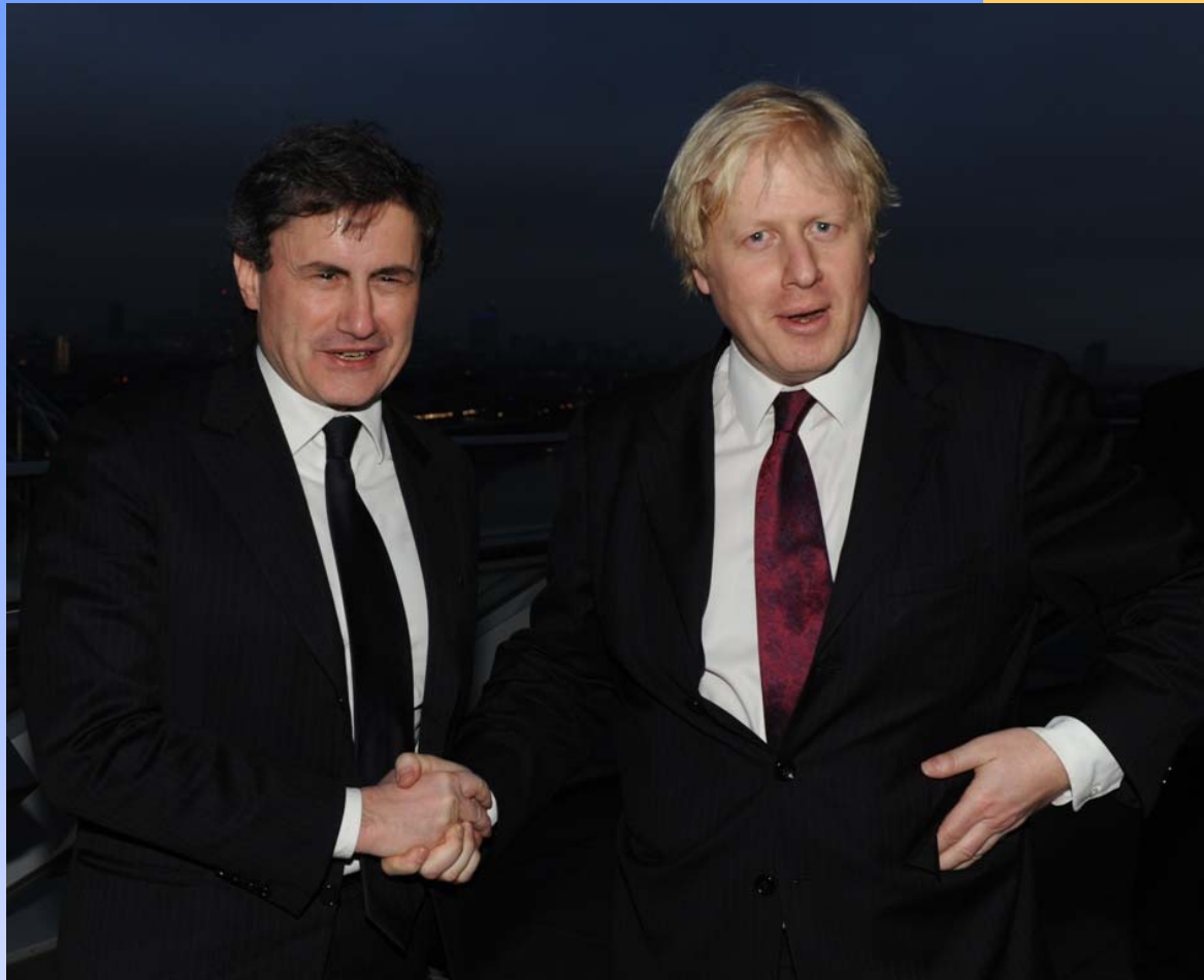
Mayors Boris Johnson and Gianni Alemanno on the City Hall roof top

Gianni Alemanno, the Mayor of Rome, made a short visit to London today during which he met Mayor of London Boris Johnson at City Hall. The two Mayors discussed urban social and environmental challenges of the XXI Century. Mayor Alemanno, presented his ambitious “zero impact city” climate change plan for the city of Rome, ahead of his participation in the Meeting for Mayors, organised at the margin of the Copenhagen Climate Summit. Mayor Alemanno’s project for Rome was the subject of a Financial Times article that appeared a few days before his visit.