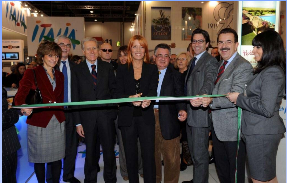
Minister Brambilla cuts the ribbon at the inauguration of the Italy section at the World Travel Market