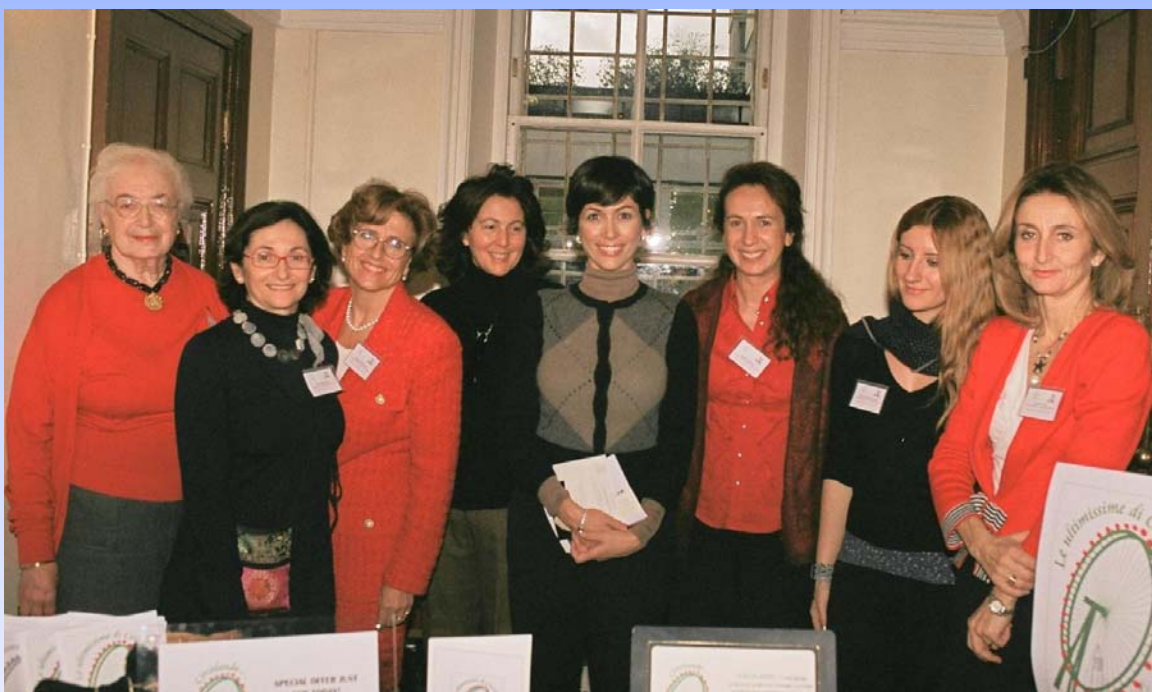
Minister Carfagna (centre) with members of the Italian Cultural Association "Il Circolo"

Mara Carfagna, Italian Minister for equal opportunities , visited London on 2-3 December and met her British counterpart and Minister of Justice, Maria Eagle during a working lunch. The aim of the visit was to discuss the possibility of a common European and international strategy to tackle the issue of violence against women, as part of Italy's G8 presidency activities on the protection of women's rights. The leader of the House of Commons, Harriet Harman, and the Labour MP Michael Foster also attended the lunch. Minister Carfagna visited a rape crisis centre and a refuge for women victims of domestic violence. She rounded out the visit by attending the annual Christmas Bazaar organised by the Italian cultural association "Il Circolo".